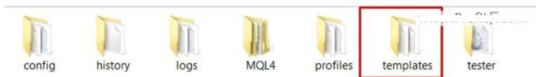
Pic.4 Templates Folder

– NOTE: Template files must be NOT in “MQL4 folder” . Copy your .tpl files into templates folder (Picture #4). You can find templates folder when open your Data Folder)