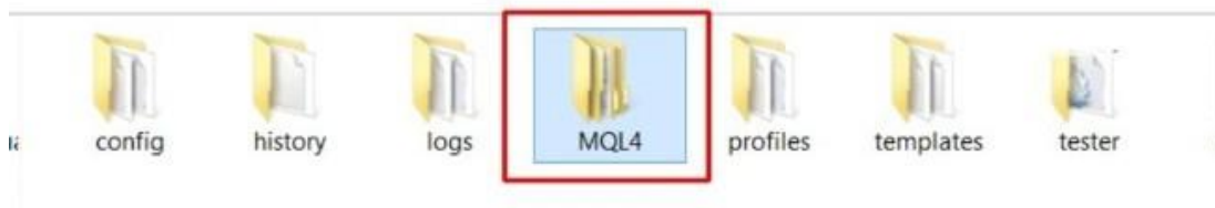
Pic.2 MQL4 Folder

Here you will find a folder called MQL4 :